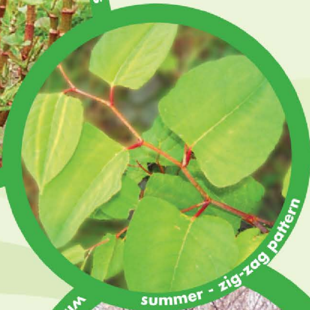
summer - zig-zag pattern