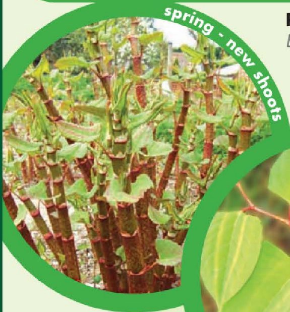
spring - new shoots