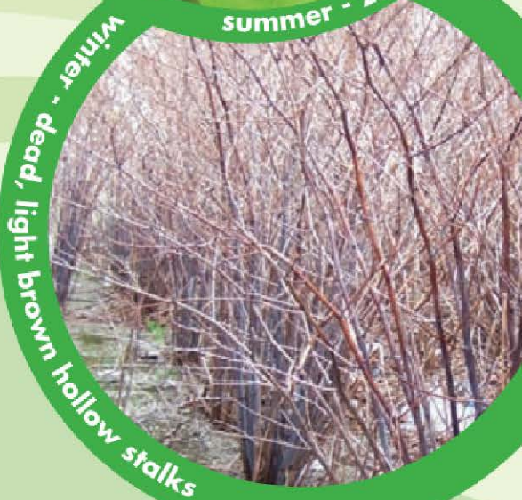
winter - dead, light brown hollow stalks